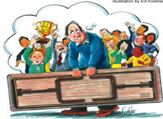
Illustration by Ed Koehler

Some are called to 'higher things.' Others are called to move tables.