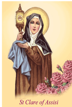
St Clare of Assisi

Call the office and leave a message to start planning your trip of a lifetime!