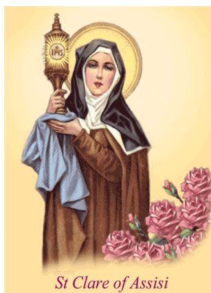
St Clare of Assisi