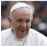
Pope Francis March 27, 2020